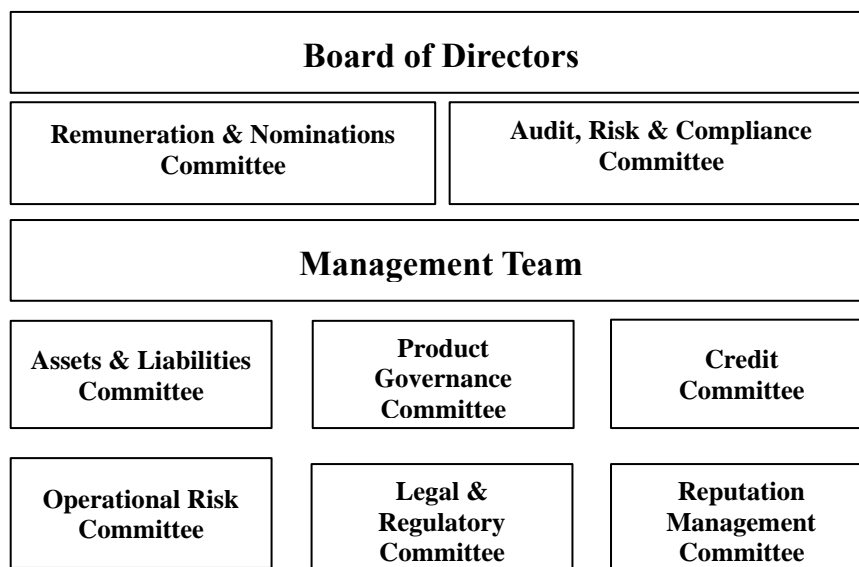
Table 1: Governance Structure

The primary structures for the current year are shown below: